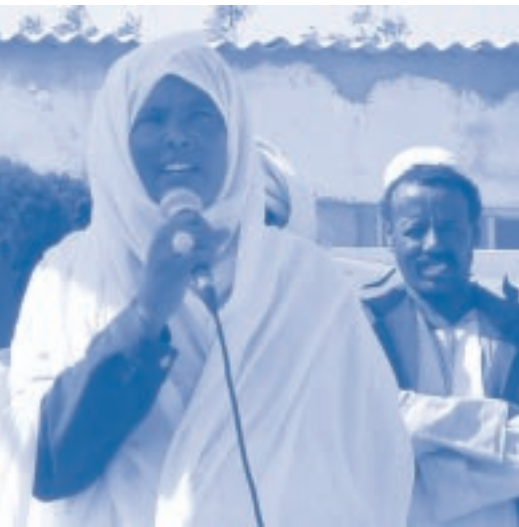
Men take a minimal role in sharing responsibility for reproductive health matters, so the burden falls mainly on the shoulders of women. Empowerment of women is an important project goal.

SFPA's integrated reproductive health centres are unique in Sudan. The centres distinguish themselves through their quality of care as well as the comprehensive package that is offered – integrated services at affordable prices.