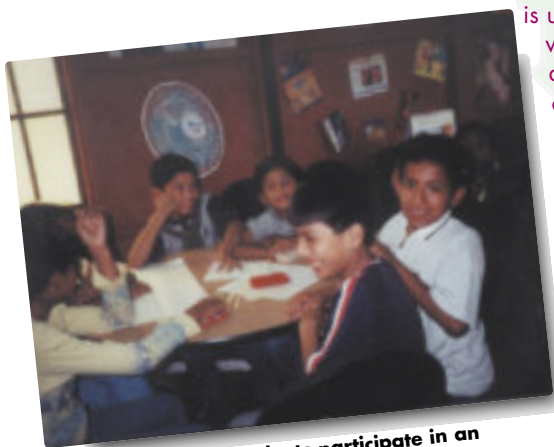
10 to 12 year old students participate in an interactive workshop at the Comas YES station.

is us, ourselves, who can achieve the changes, that we are part of the solution, not part of the problem."