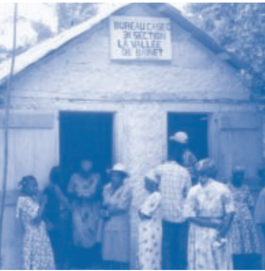
Building used by the mobile medical team during a visit in the Jacmel region. Community support is evident through their provision of premises for mobile team visits.

The Ministry of Health does not have the resources to provide even the most basic services to the majority of the Haitian population. PROFAMIL therefore fills a critical niche, and is responding to the needs of the most marginalised Haitians by providing services to the critically poor in Haitian urban centres and serving people in hard-to-reach rural areas who do not have access to any kind of health services.