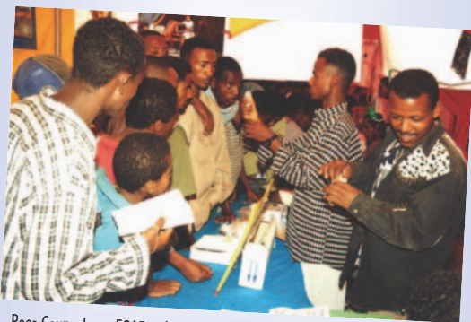
Peer Counselors - FGAE, Ethiopia

SRH education can be integrated into informal contexts such as sports camps and youth centres and can also take place through workshops in work places and schools.