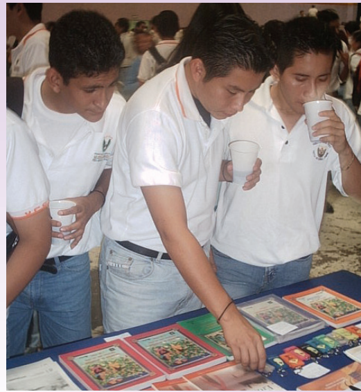
HIV/AIDS campaign by the young volunteers of MEXFAM – Mexico

Giving young people more access to information about their rights and more support for practicing them encourages a new collective mind set which can enable them to fight for things they believe in and to break social norms and taboos that forbid them from practicing and discussing things that are central to their lives