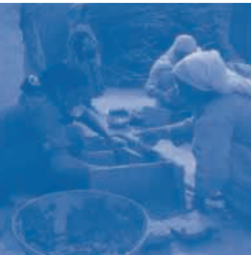
Skills training and income-generating activities are an important entry point to embark on the culturally more sensitive issues of sexual and reproductive health.