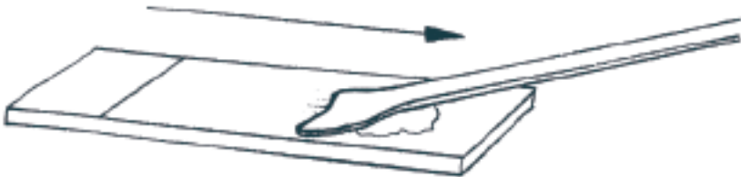
Figure 4.3 Spreading the cervical scrapings onto a glass slide

A single slide is almost always sufficient, but if there is a large amount of material a second slide may be needed. If only a scanty sample is obtained, a second scrape may be indicated. If two samples (e.g., scrape and brush or two scrape samples) are spread on one slide, the first sample should be fixed before the second sample is obtained.