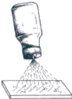
Figure 4.4 Spray-fixing smear

The spray must not be held closer than 15 cm from the slide or it may tend to wash the specimen away. The various spray fixatives marketed contain an aerosol agent and different mixtures of alcohol, acetic acid, or ethylene or propylene glycol. Once spray-fixed slides are dry (usually within 10 minutes), they can be dispatched to the laboratory for staining directly without additional measures. Commercially available spray